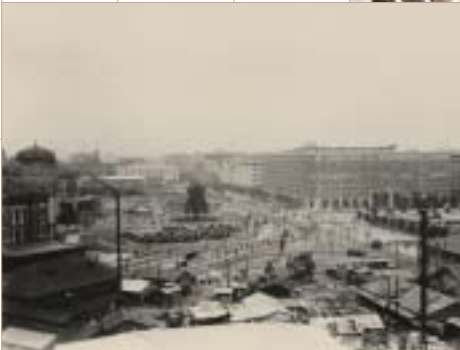
Area surrounding Tokyo Station, circa 1927