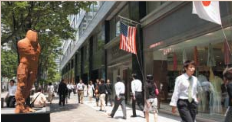
Marunouchi Naka Dori ▶▶

The first project of the second stage is the Marunouchi Park Building, planned for completion in the spring of 2009. The project includes Mitsubishi Estate’s point of departure in its long journey of creating communities—the restoration of Mitsubishi Ichigokan as a museum. The second project is