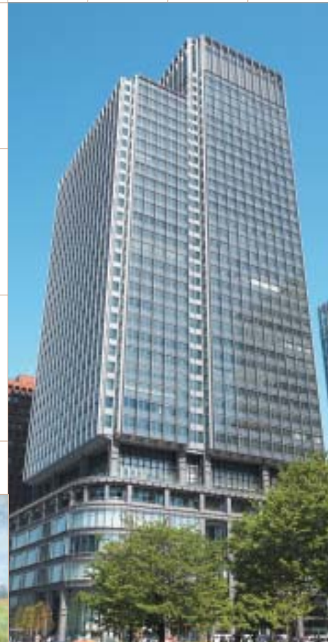
The Shin-Marunouchi Building opened in April 2007.