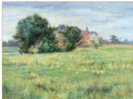
Mitsubishi-ga-hara, circa 1889 (painting by Fukuhide Gunji)