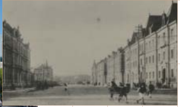
Babasaki Dori in the "London Block," circa 1907