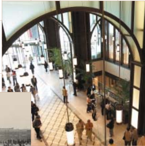
Shin-Marunouchi Building entrance