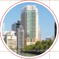
⑥ The Peninsula Tokyo Completed in May 2007 Opened in September 2007